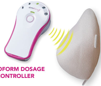
AEROFORM DOSAGE CONTROLLER

4. How does AeroForm fit into my reconstruction plan?